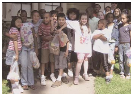
2007 photo of Washington Schools students visiting the Old Manchester Museum.

Each year every third grade class in the Manchester school system has the opportunity to visit the Cheney Homestead, History Center and Old Manchester Museum. At each site, the children learn about how people lived during different periods of history. The scheduling involves over 100 volunteers to guide and assist with this undertaking. (There is no charge to the students or schools for this service—it is the Historical Society performing its vision.) Each student is given a cocoon and the story of how it emerges.