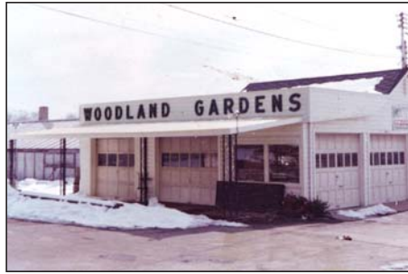
Woodland Gardens c. 1954