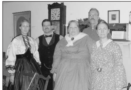
Travel back in time: Learn about our history by living it!