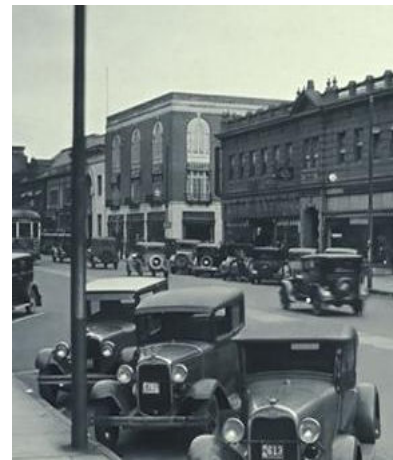
Watkins and other Downtown buildings