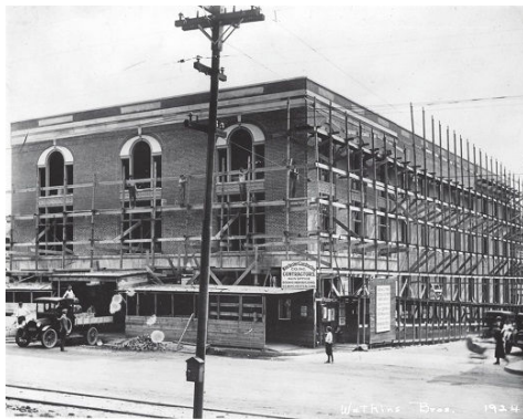
Watkins building under construction, 1920, a project of the Manchester Construction Company, owned by The Knofla brothers.

Watkins store opening, November 1920, with special music and tours.