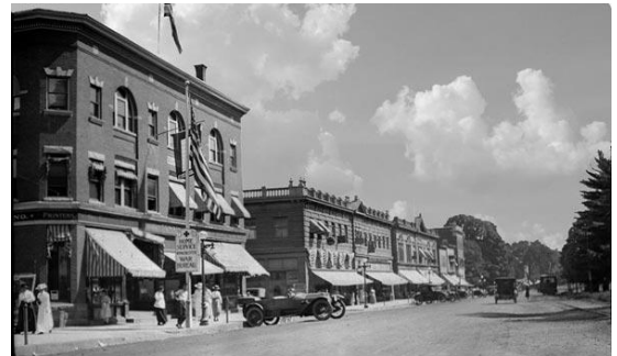
Ferris building, facing Main St.