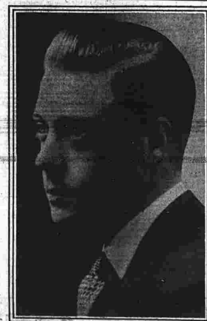
FORMER KING EDWARD VIII