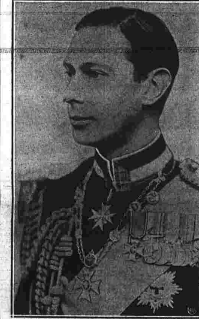
HIS MAJESTY KING GEORGE VI

Premier Baldwin Reads King's Message to Commons; "After Long and Serious Consideration I Have Determined to Renounce the Throne," He Writes; Premier Gives Details of His Efforts to Change Edward's Final Decision and How He Failed in the Attempt.