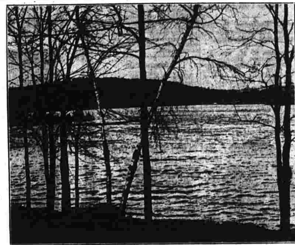
Section of scenic Bolton Reservoir donated this week to the State by the Connecticut Light and Power Company. American Threading Company, Willimantic and Case Fibre Company of Andover for public recreation.