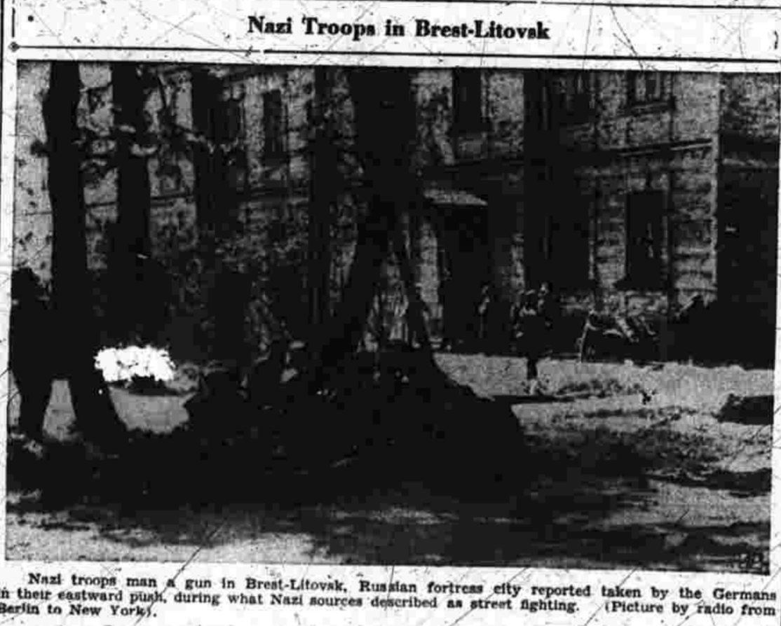
Nazi troops man a gun in Brest-Litovsk, Russian fortress city reported taken by the Germans in their eastward push, during what Nazi sources described as street fighting.