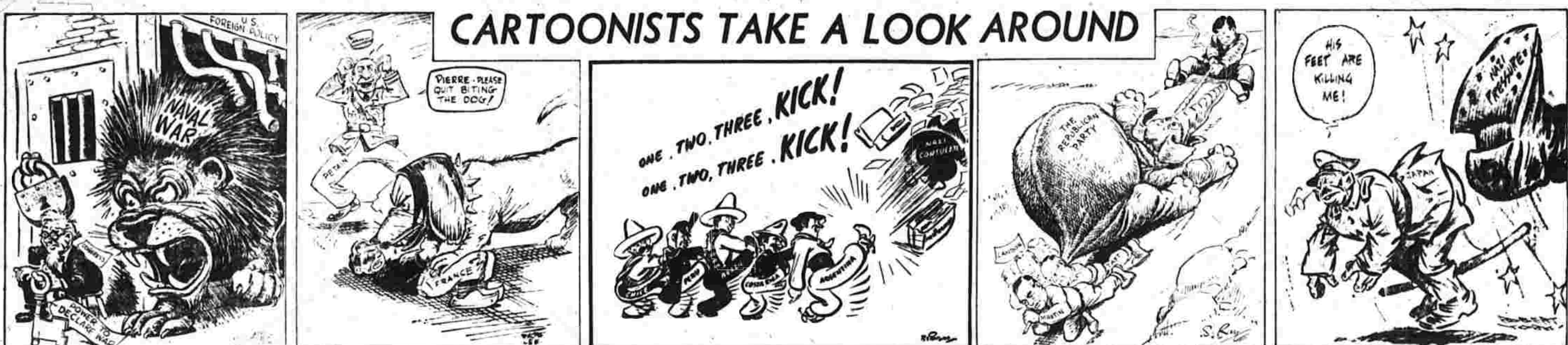
Cartoonists take a look around. The artist in Detroit Free Press. The artist in Boston Globe. The artist in New York Times. The artist in Washington Post. The artist in Chicago Tribune. The artist in Philadelphia Record. The artist in St. Louis Post-Dispatch. The artist in Cincinnati Enquirer. The artist in Cleveland Plain Dealer. The artist in Detroit Free Press. The artist in Boston Globe. The artist in New York Times. The artist in Washington Post. The artist in Chicago Tribune. The artist in Philadelphia Record. The artist in St. Louis Post-Dispatch. The artist in Cincinnati Enquirer. The artist in Cleveland Plain Dealer.