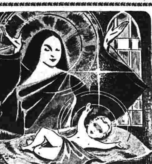
May Christmas bring you Enough blessings to brighten Every moment, every hour... CLOSED SATURDAY, DEC. 23

Fresh from our new mill every day. Fresh variety of apples for sale. ANSALDI'S STAND BOLTON