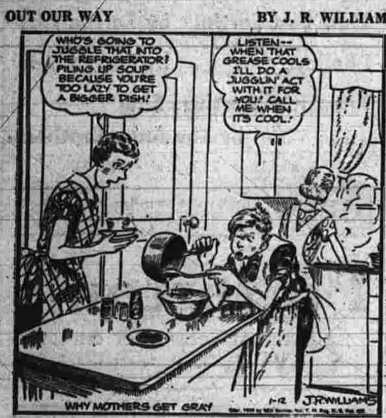
OUT OF WAY BY J. R. WILLIAMS