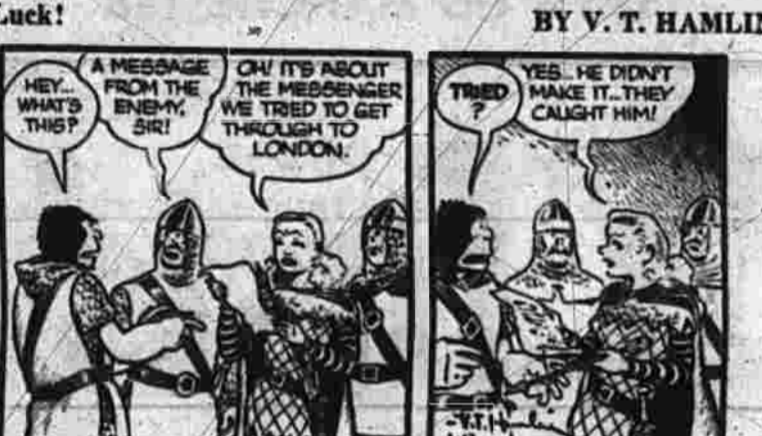
No Luck! BY V. T. HAMLIN