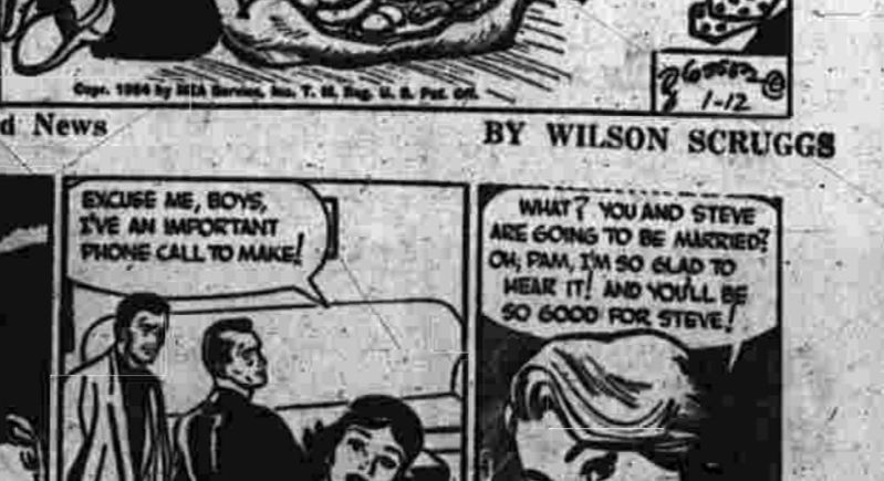
Good News BY WILSON SUGGS