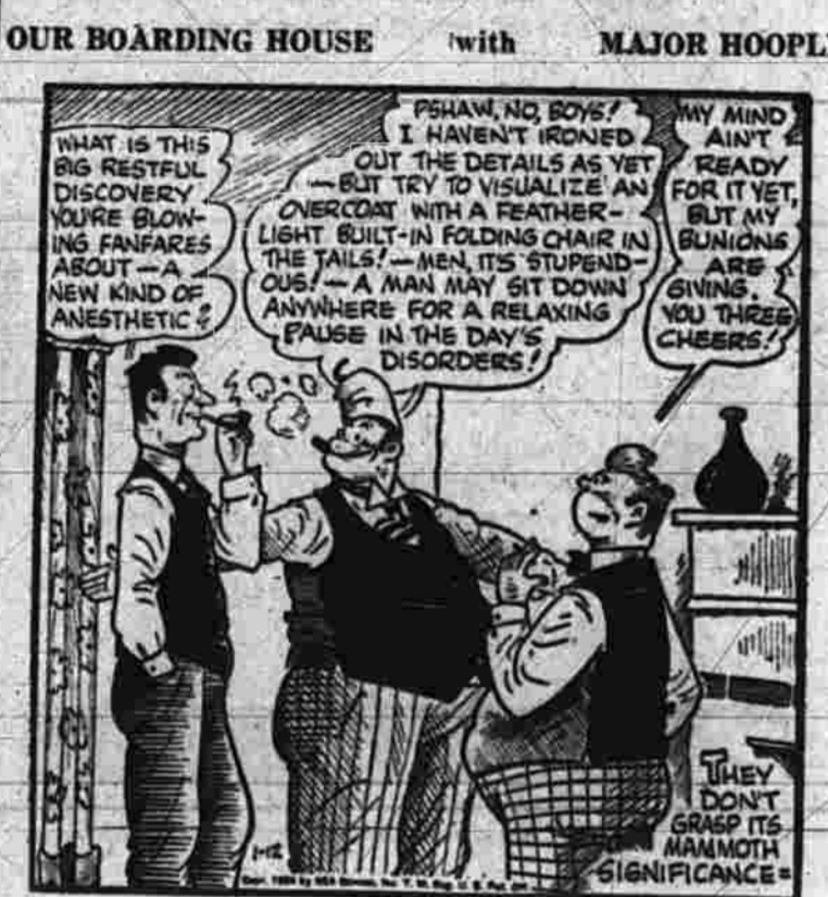
OUR BOARDING HOUSE BY MAJOR HOOPLE