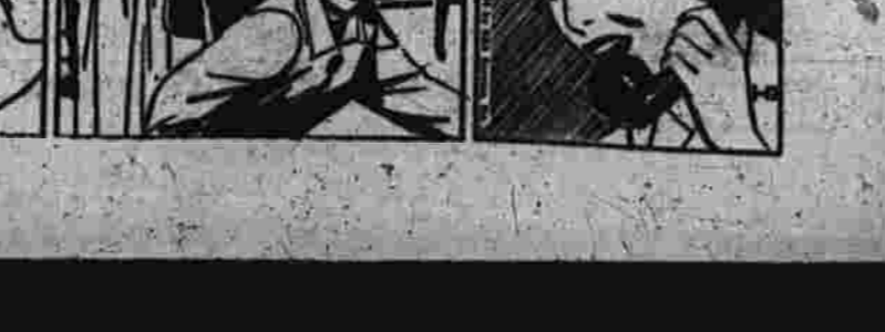
Good News BY WILSON SUGGS