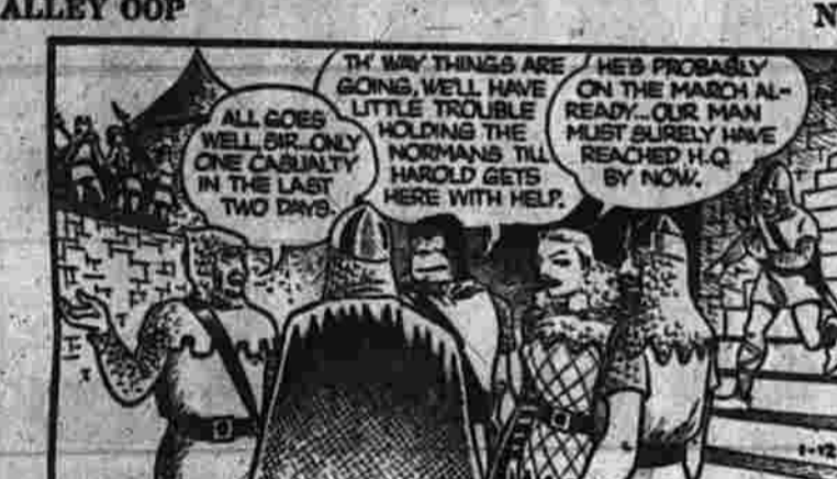
ALLEY OOP BY V. T. HAMLIN