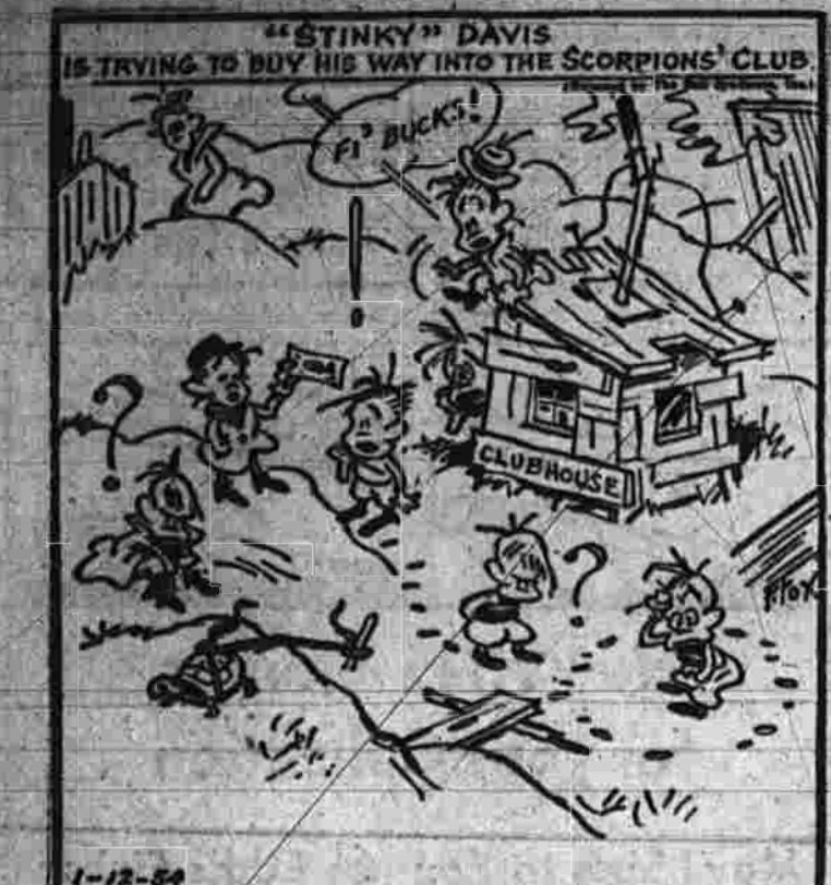
STINKY DAVIS BY FONTAINE FOX