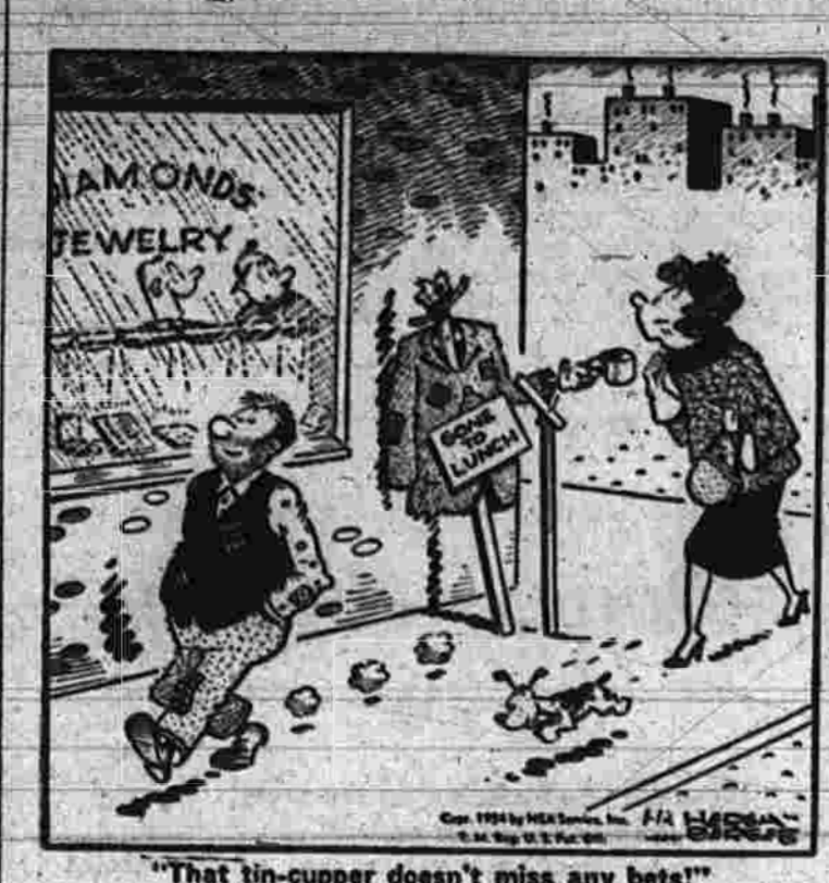
DIAMONDS JEWELS BY HERSHBERGER