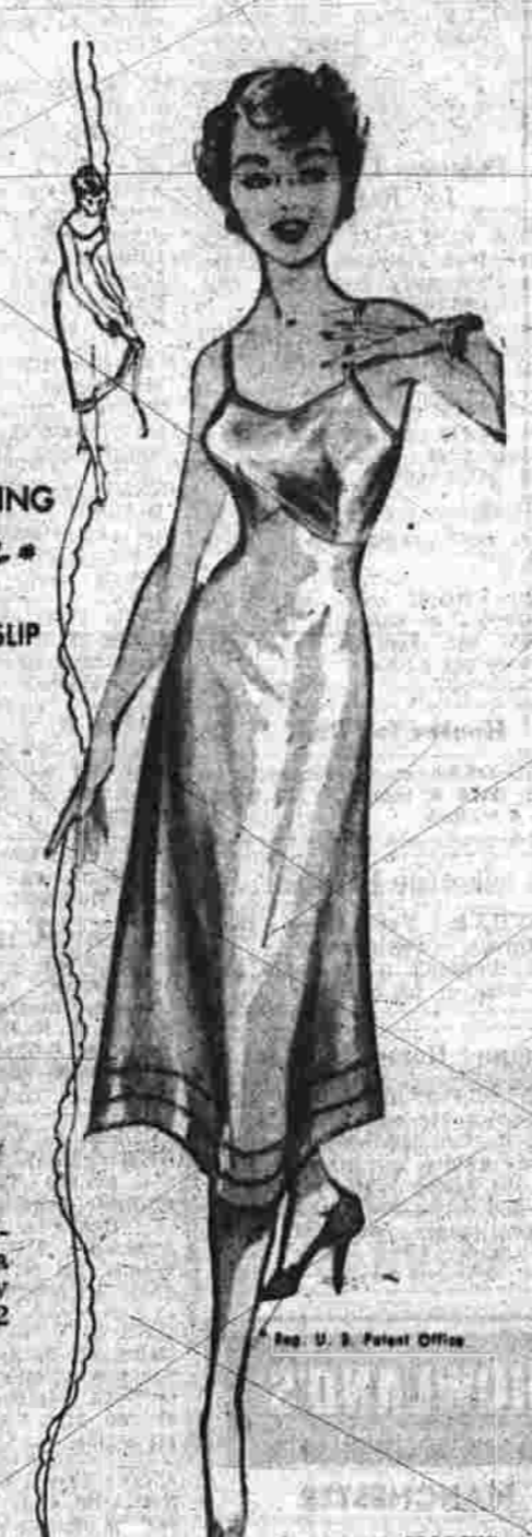
HALLE'S LINGERIE DEPT. Main Floor

ALL SALES FINAL GIRLS' DEPT. - second floor