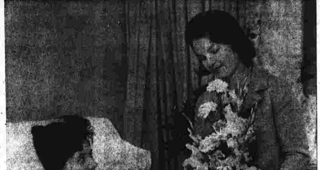
Thirty-four members of the Junior Auxiliary (Pinks) of Manchester Memorial Hospital will be capped tomorrow in ceremonies in the Doctor's Dining Room at the hospital.

While many adults go to extremes to avoid banishment to the "doghouse," these Bristol youngsters are having fun there. This row of doghouses, used for sale in the neighborhood, provide a convenient vehicle for the leisure time of the children.