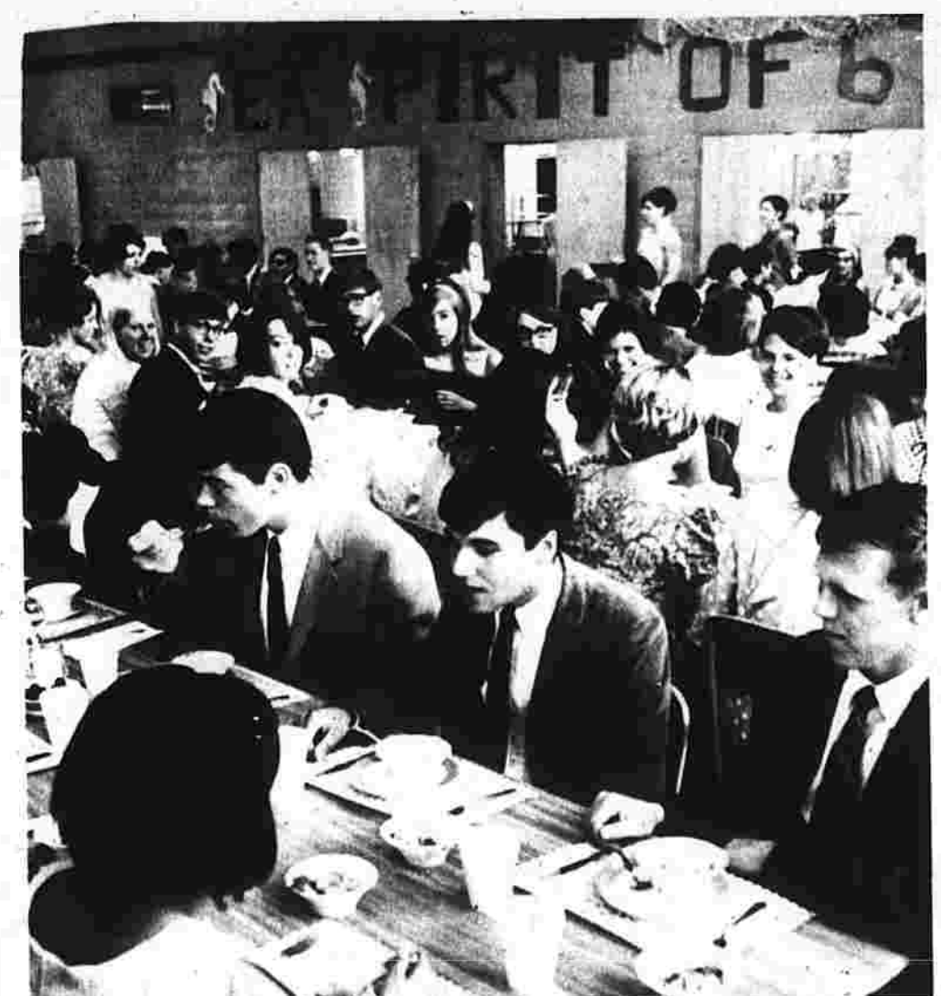
Experiences Reminisced at Banquet