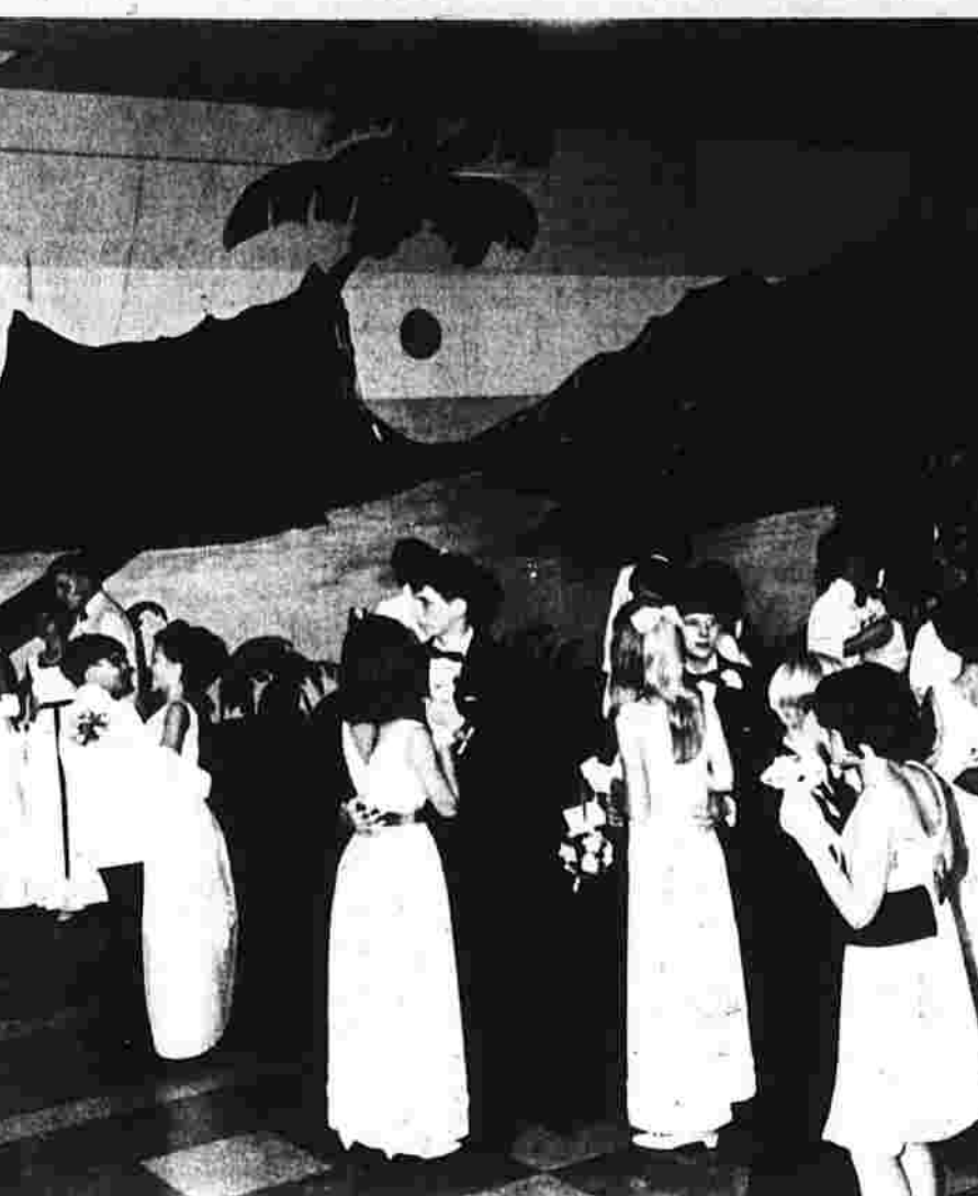
Tropical Atmosphere Prevails at Reception