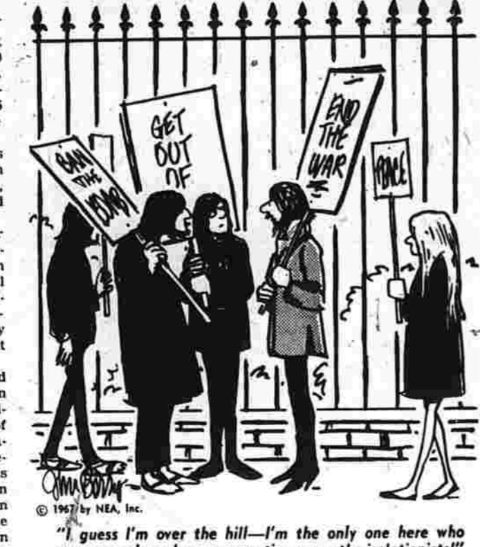
"I guess I'm over the hill—I'm the only one here who can remember when conservatives were the isolationalists!"