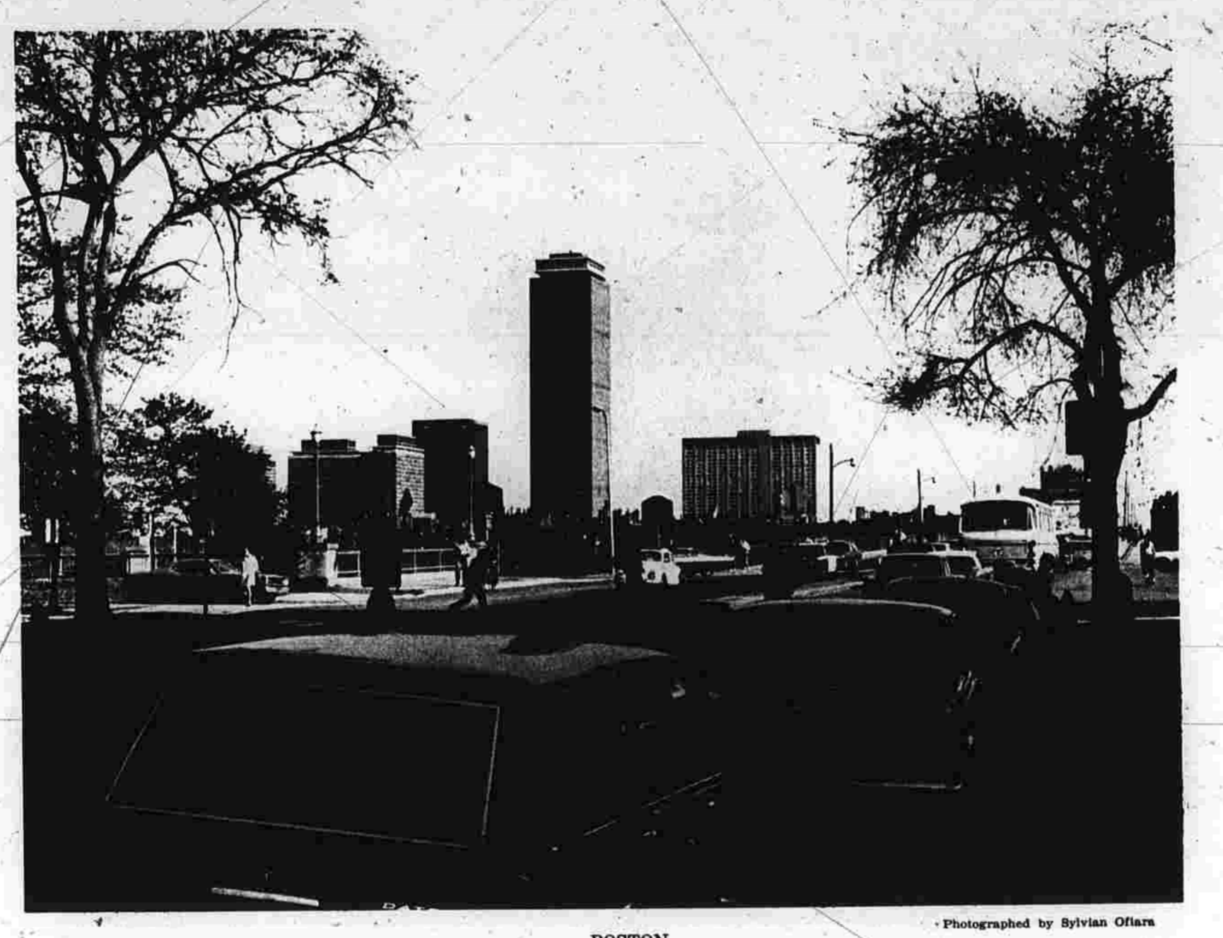
BOSTON — Photographed by Sylvia Ottens

It was a decision not to reach for any more inflationary-type stimulus for the "economy" in an effort to speed an improvement in the nation's employment picture.