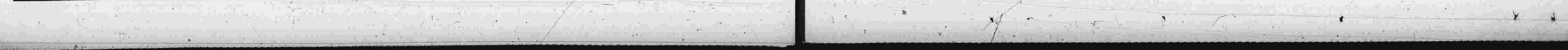
Eleven month-old St. Bernard puppies pose on an Iowa washline on a sunny day.