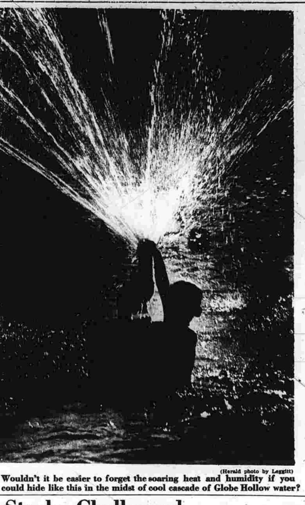
Wouldn't it be easier to forget the soaring heat and humidity if you could hide like this in the midst of cool cascade of Globe Hollow water?

NEW YORK - From 1955 to 1967 the firm of Currier and Ives, lithographers, published about 7,000 different prints that have been received from HELCO.