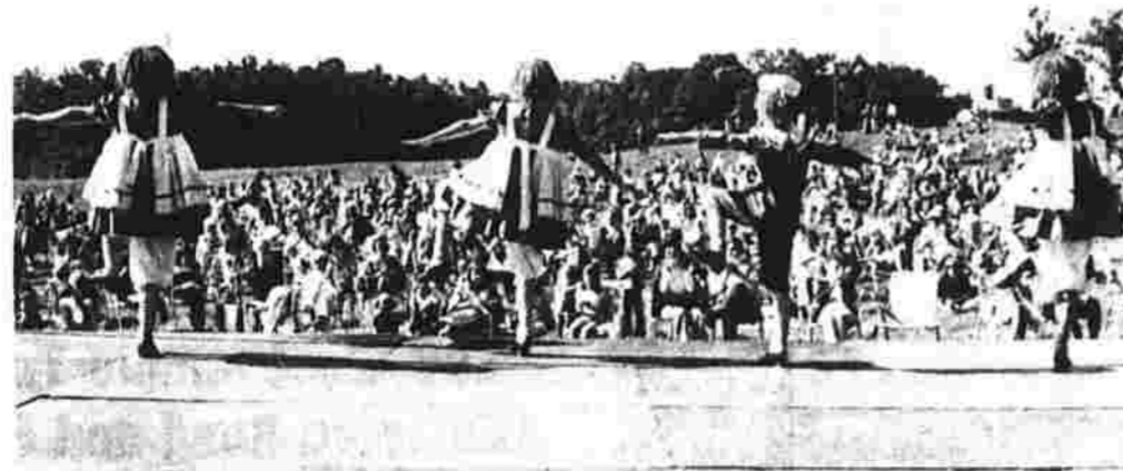
Dancers from the Burton Dance Studio perform for the crowd at the band shell dedication. Spectators sat on the slope with forms a natural amphitheater.

Promoters of the band shell said they were happy with the results and felt the "Afternoon of Entertainment" would make the shell seem like a more concrete project to Manchester residents who are being asked to contribute money toward it.