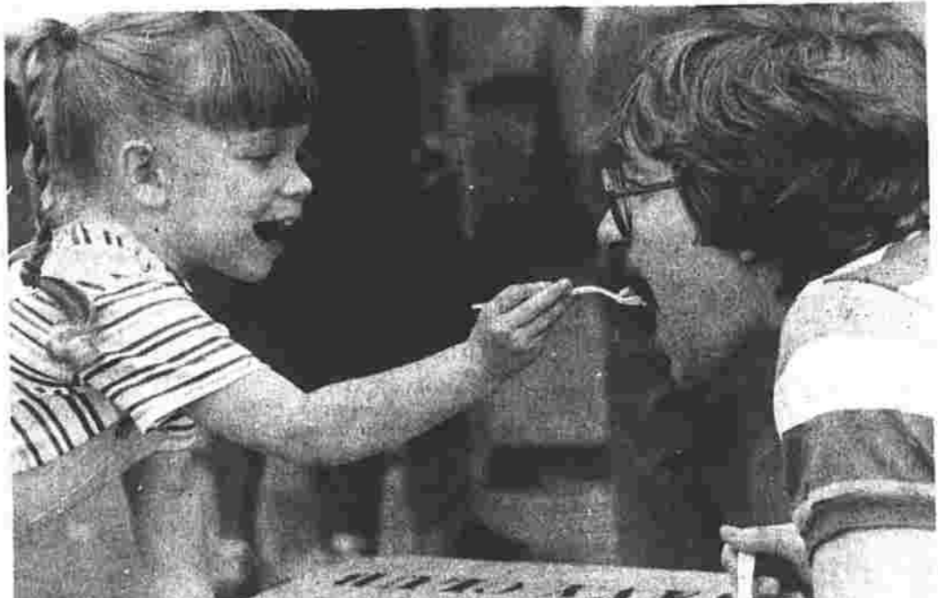
Strawberries for Daddy

At least two members of the Board of Directors will urge their colleagues to cut off all discussions with the Human Relations Commission about affirmative action. They say they believe the commission is unfairly characterizing the board as lacking a commitment to minority hiring.