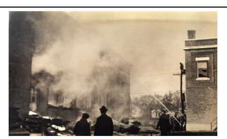
Fire at the Herald's Hilliard St. building, November 18, 1922. [Webmaster's note February 2016: Fixed up, the building became the home of Able Coil. It is still there, on the south side of Hilliard St. near the intersection with Main St.]

During Scripps League's ownership, the Herald was further modernized with the introduction of a computerized editorial system. The Herald was voted New England's Newspaper of the Year by the New England Newspaper Association in 1990.