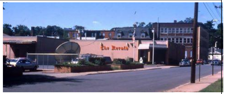
Circa 1980 photo of The Herald building on Brainard Place, looking west toward Main Street.

Second article , "Herald Was First Issued in 1881," The Hartford Courant , Sunday, September 30, 1923, page 74. Note that 1923 was the 100<sup>th</sup> anniversary of Manchester's incorporation, and an occasion to look at its history and accomplishments.