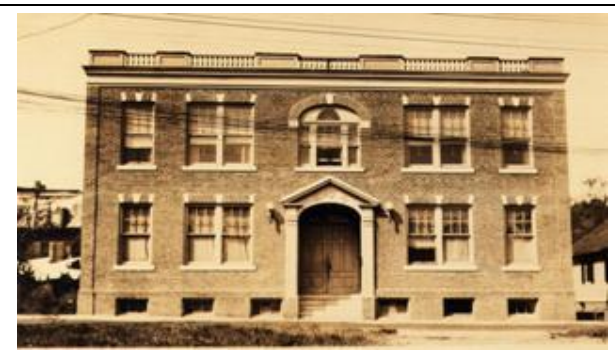
Knights of Columbus building on Bissell Street, before The Herald bought the building in 1928.