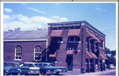
Circa 1965 photo of The Herald building on Bissell Street, looking east toward Spruce Street.