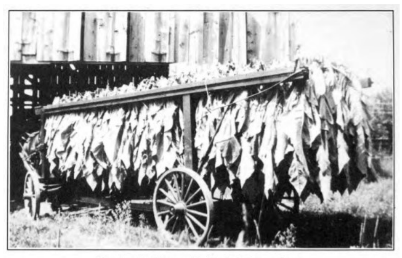
Entering Lacy's barn with a load of tobacco to hang.