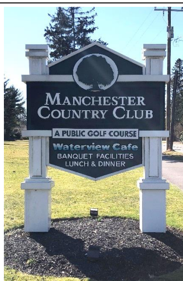
Sign at Country Club, 305 South Main Street. Spring, 2020.