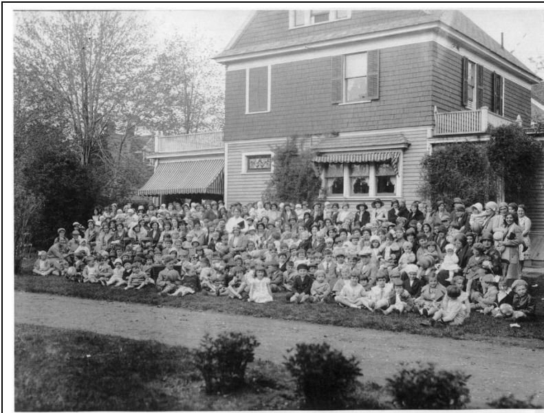
Contemporary photo of the house, 52-54 Wadsworth St.