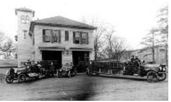
Cheney Fire Station

The Bath House provided a place to bathe for Cheney workers who did not have bathrooms at home. Men bathed on one side and women on the other. Towels cost 5 cents.